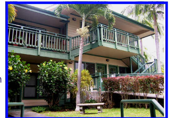
Full Life office and Learning Center, Kainaliu